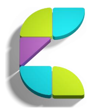
CIVIC Computing (UK) – an Edinburgh-based digital agency and project coordinator