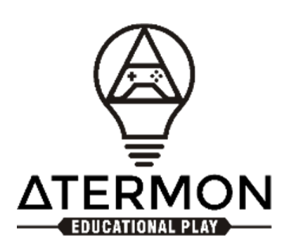
Atermon (NL) – a Dutch company specialising in gamification and educational technology