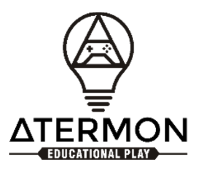
ATERMON (NL) – a Dutch company specialising in gamification and educational technology