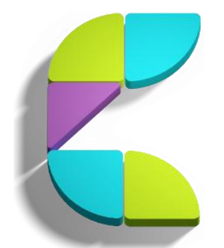
CIVIC Computing (UK) – an Edinburgh-based digital agency and project coordinator